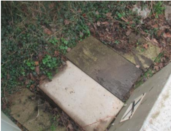
Condition of chamber covers