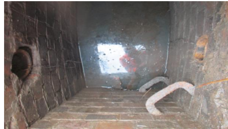
Condition of chamber