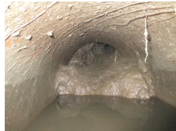
Condition of Inlet Pipe