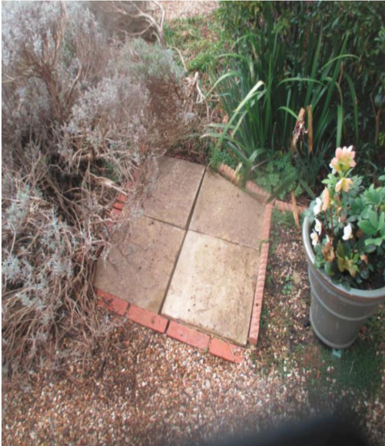
Condition of chamber covers (steel cover underneath slabs)