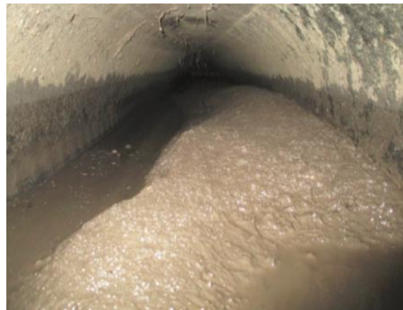
Condition of Outlet Pipe