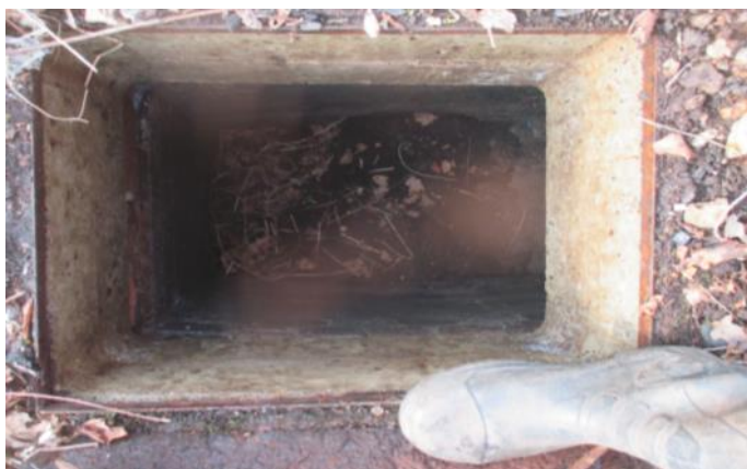
Condition of chamber and cover