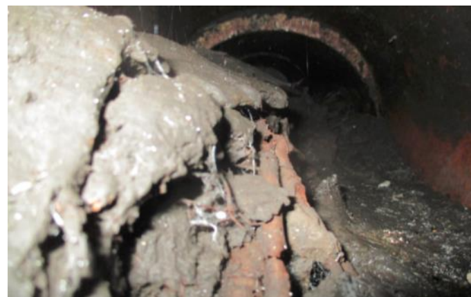
Condition of Inlet and Outlet Pipes